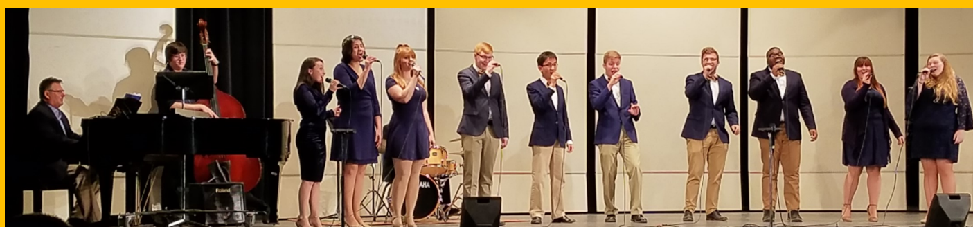
Nova Jazz Singers of Kent State University