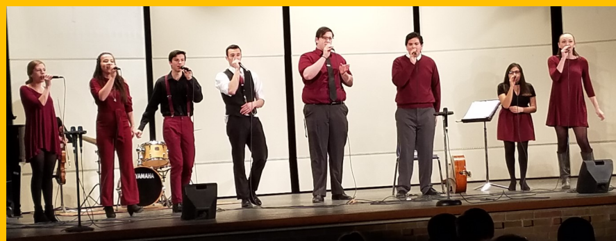
Special Edition of North Olmsted HS