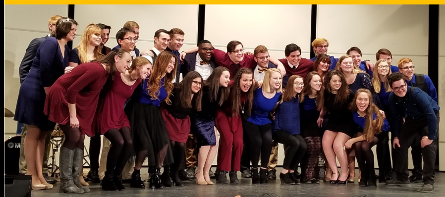
Group photo of performers of all three ensembles.

OFMA was proud to partner with Angelina's Pizza to supply dinner to the performers of OFHS Golden Expressions, North Olmsted Special Edition and Kent State Nova Jazz Singers before the evening's event.