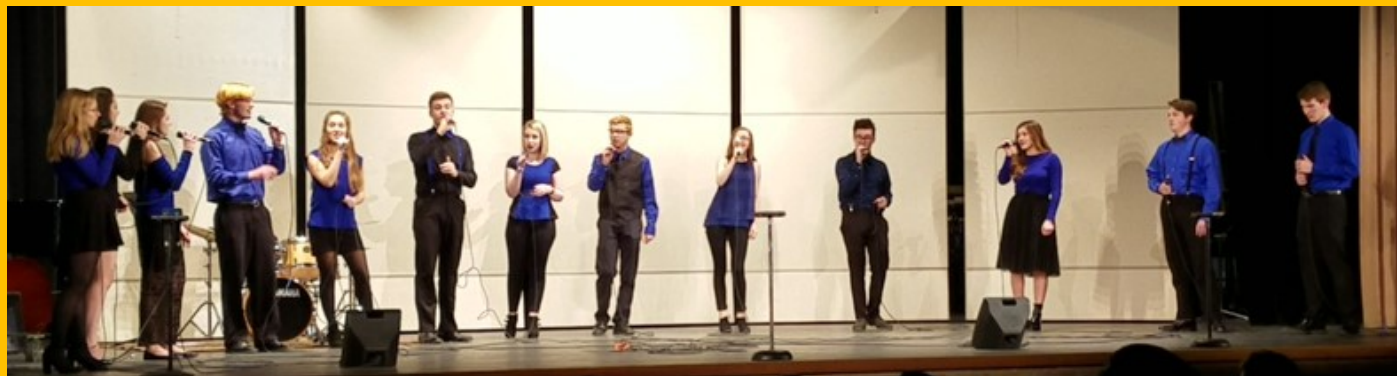
Golden Expressions of Olmsted Falls HS

On Jan. 30th, OFHS's Golden Expressions held its first GE Jazz Invitational featuring performances from Special Edition of North Olmsted HS, Nova Jazz Singers of Kent State & Golden Expressions.